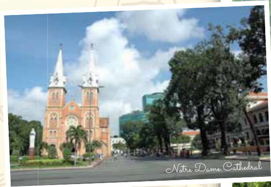
Notre Dame Cathedral