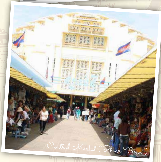
Central Market (Phsar Thmei)