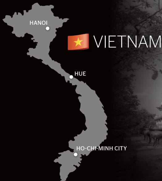
Hué, imperial city

POPULATION : approximately 98 million. AREA: 127,890 sq. mi. (331 000 km 2 ). CAPITAL: HANOI.