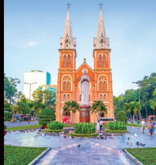
Notre Dame cathedral of Saigon

The Chinese District, Cholon, where nearly half the population lives, is teeming with life and vibrant marketplaces. Yet, a quick step inside one of the grand temples brings a sudden sensation of peace and serenity.