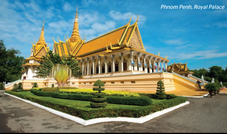
Phnom Penh, Royal Palace