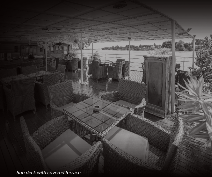
Sun deck with covered terrace