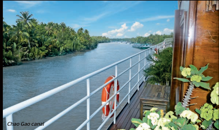
Chao Gao canal

CroisiEurope is the only river cruise company authorized to cross through the Chao Gao Canal, the tree- and temple-lined channel that links Ho-Chi-Minh City to the Mekong Delta. Stretching over 28 km (17 miles), the canal is a vibrant conduit for cargo ships, barges, and skiffs brimming with rice, fruit, fish, sand, or fuel.